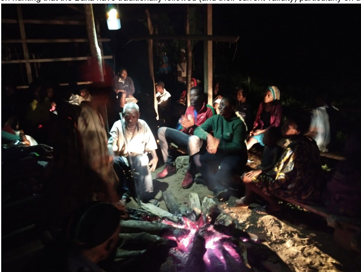
Fig. 2. One the village elders from Doum recounting traditional stories and legends about hunting by the Baka. The Darwin team recorded these tales to inform our knowledge and understanding of hunting practices in our study communities.

<sup>3</sup> <a href="https://www.nature.com/articles/s41598-021-83223-y">https://www.nature.com/articles/s41598-021-83223-y</a>. This paper is Open Access thanks to funding from USAID via CIFOR to the Project Leader.